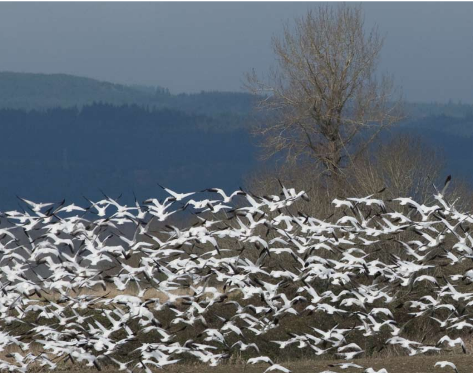
Snow Geese at Sauvie Island by Vernon DiPietro