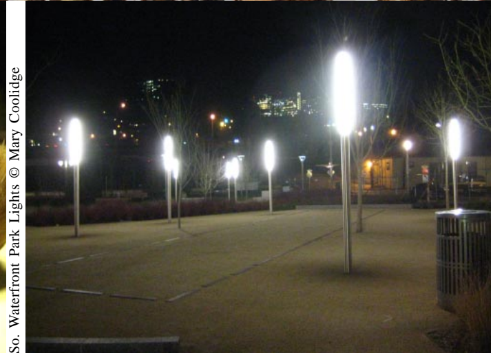
So. Waterfront Park Lights