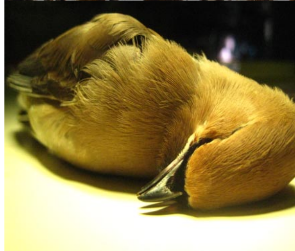
Cedar Waxwing © Mary Coolidge