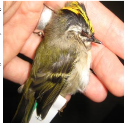
Golden-crowned Kinglet