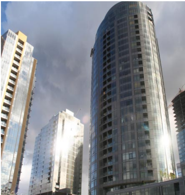
South Waterfront

http://audubonportland.org/issues/metro/birdsafe