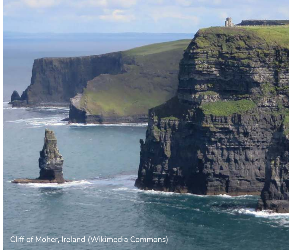
Cliff of Moher, Ireland