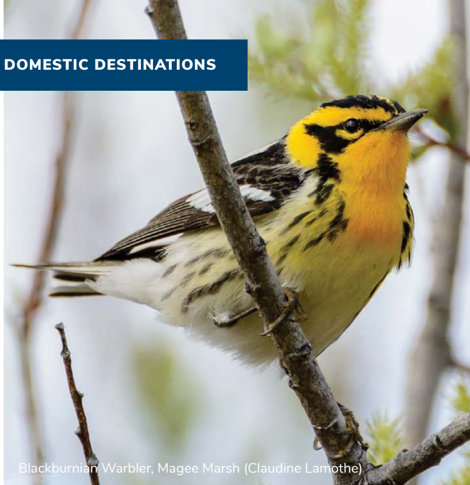
Blackburnian Warbler, Magee Marsh (Claudine Lamothe)