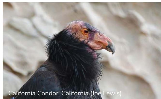
California Condor, California