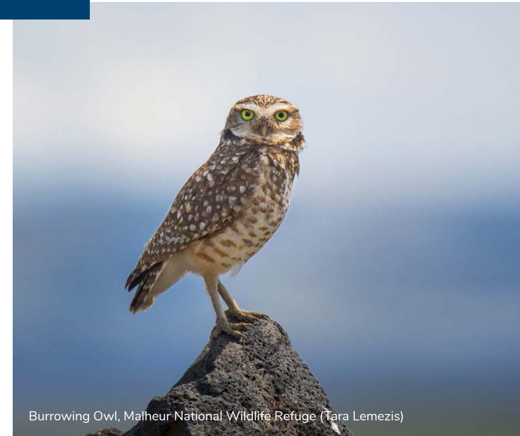
Burrowing Owl, Malheur National Wildlife Refuge (Tara Lemezis)