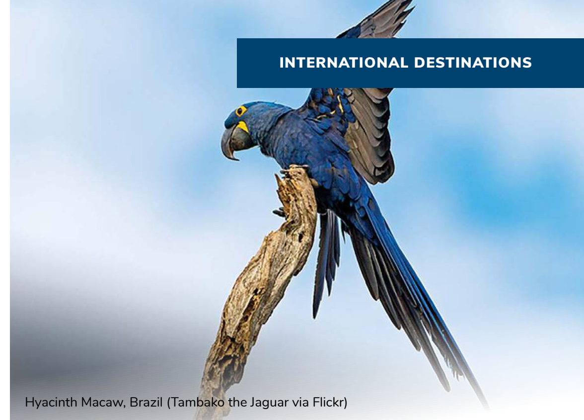
Hyacinth Macaw, Brazil