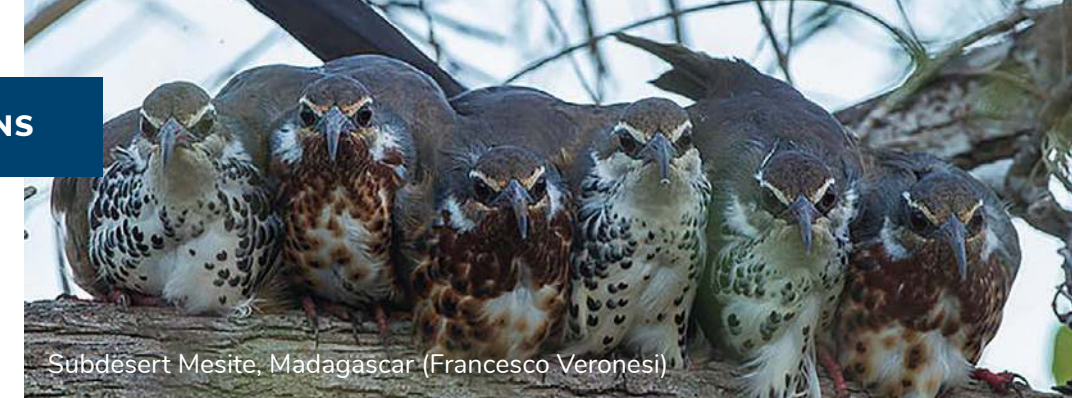
Subdesert Mesite, Madagascar