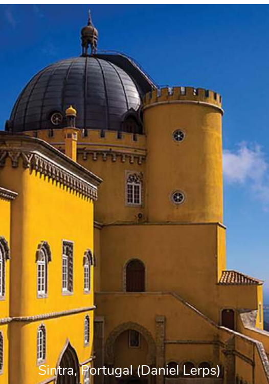
Sintra, Portugal