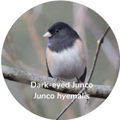
Dark-eyed Junco Junco hyemalis