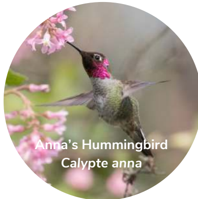
Anna's Hummingbird Calypte anna