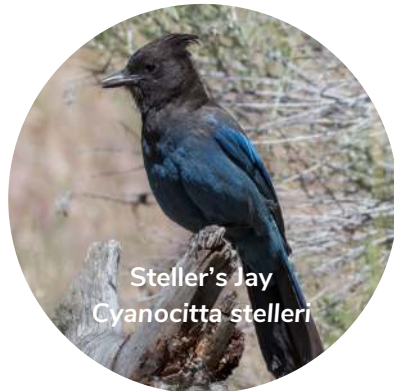
Steller's Jay Cyanocitta stelleri