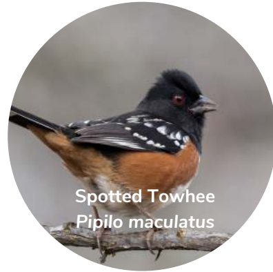
Spotted Towhee Pipilo maculatus