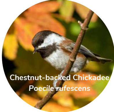
Chestnut-backed Chickadee Poecile rufescens