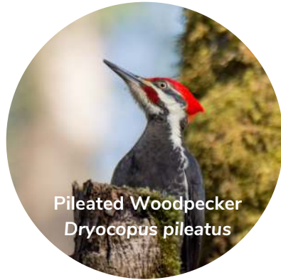
Pileated Woodpecker Dryocopus pileatus