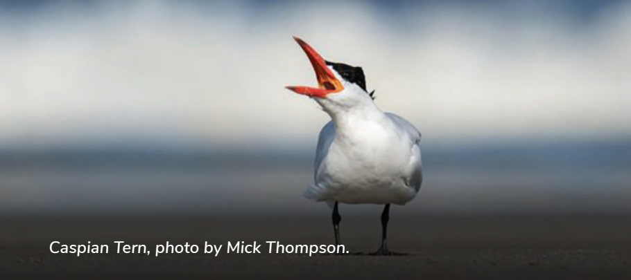
Caspian Tern