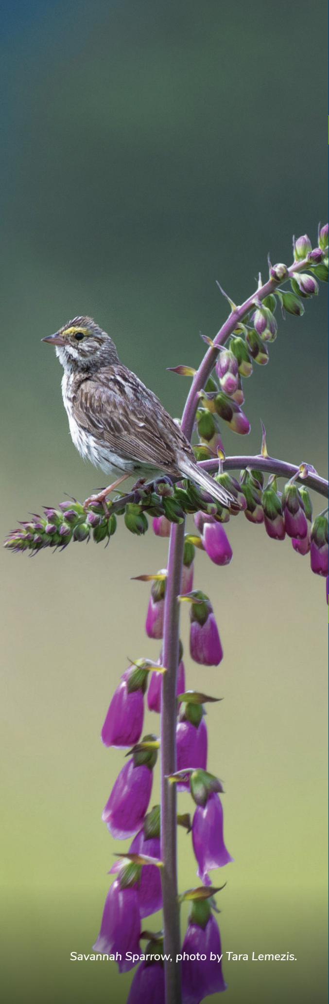
Savannah Sparrow

Portland Audubon gratefully acknowledges these special gifts: