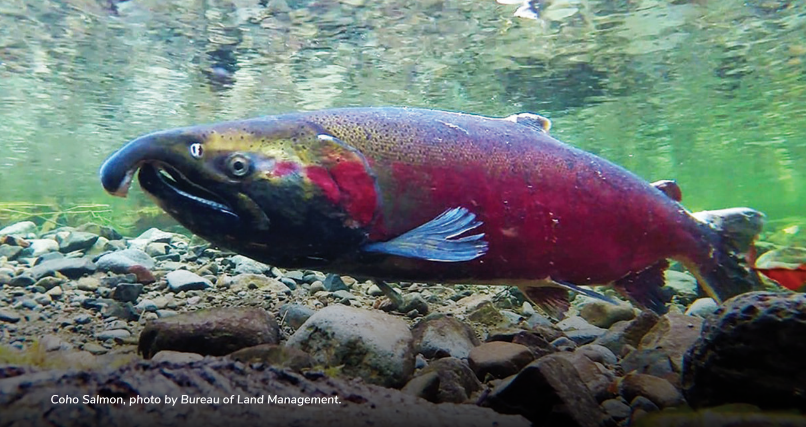
Coho Salmon