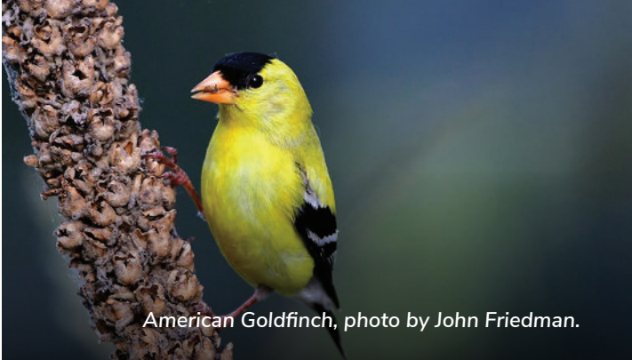
American Goldfinch

Birding From Home is our virtual series designed to help backyard birders take a deeper dive into the wonder of local birds and the healing power of nature.