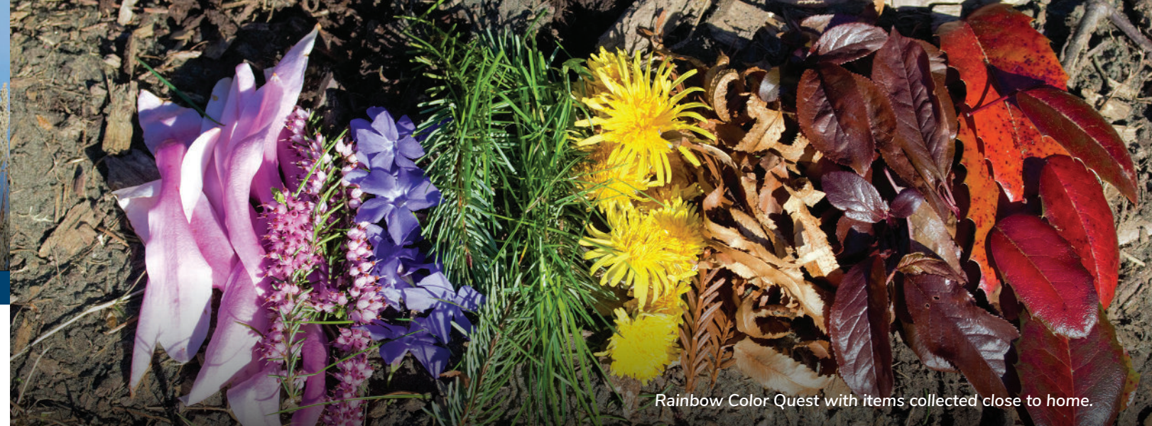
Rainbow Color Quest with items collected close to home.

Register early to receive the lowest price for 2021 trips! *Only the deposit is required now and Early Bird Pricing is guaranteed when final payment is due, 120 days before trip departure.