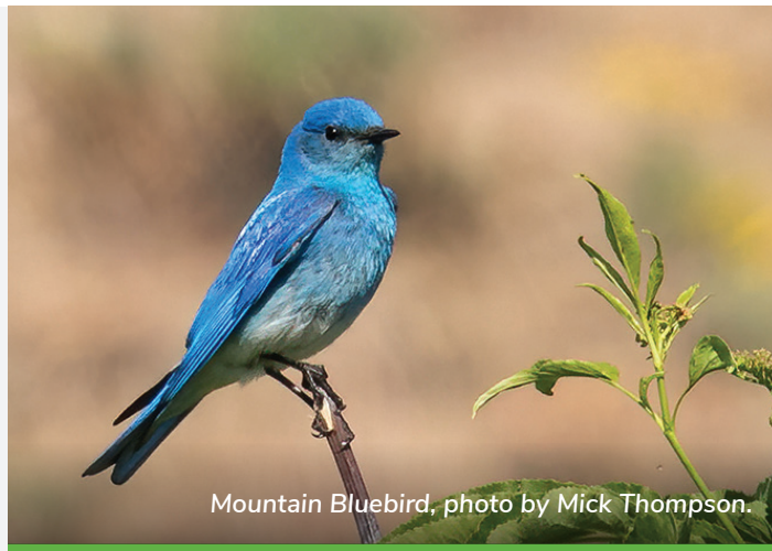
Mountain Bluebird