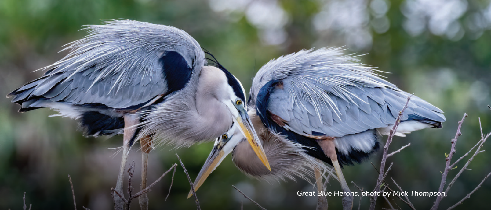
Great Blue Herons, photo by Mick Thompson.