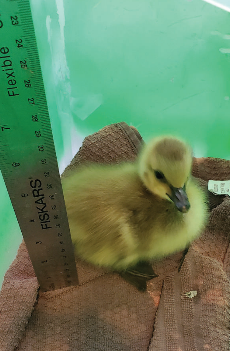
An orphaned gosling is measured in the Wildlife Care Center as staff and volunteers plan to find it an adoptive family. Canada Geese willingly adopt orphans who are around the same age as their brood.

Second, we have closed the interior of the building to all but essential personnel and moved to no-contact animal