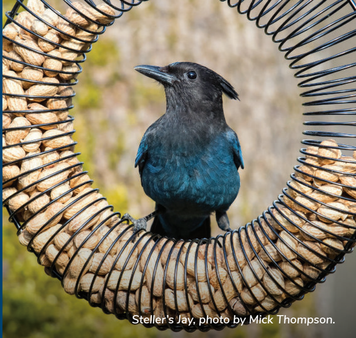
Steller's Jay

Swarovski does it again! The new dG Digital Guide combines the latest technology with Swarovski's trusted and top-of-the-line optics. This 8x25 monocular includes a digital camera, allowing you to take photos of whatever you are looking at. Connect up to five devices and view in real time what you are seeing through the dG on your phone or tablet. Not sure what bird you are seeing? The dG creates a Wi-Fi hotspot and connects with multiple apps, including Merlin Bird ID, allowing you to identify the bird on the spot. Call or email the Nature Store to ask about our rental program or for more details.