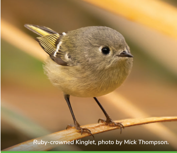
Ruby-crowned Kinglet

After months of silent woods and forests where birds appear to be nonexistent, people are again surprised how noisy the woods are when the birds are in song.