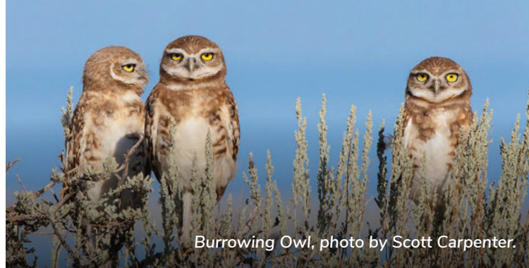
Burrowing Owl, photo by Scott Carpenter.

Fee includes: Ground transportation, double-occupancy lodging, meals except dinners, entrance fees for planned activities and the services of your leaders. Airfare not included.