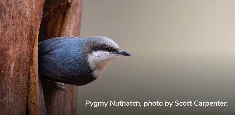
Pygmy Nuthatch, photo by Scott Carpenter.