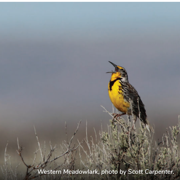
Western Meadowlark.

Portland Audubon inspires all people to love and protect birds, wildlife, and the natural environment upon which life depends.