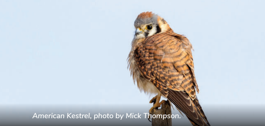
American Kestrel.

Visit audubonportland.org/events for a full list of all upcoming events.