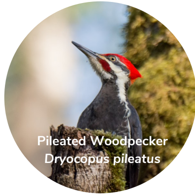
Pileated Woodpecker Dryocopus pileatus