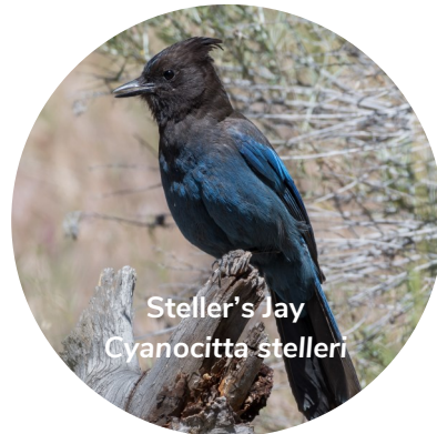
Steller's Jay Cyanocitta stelleri