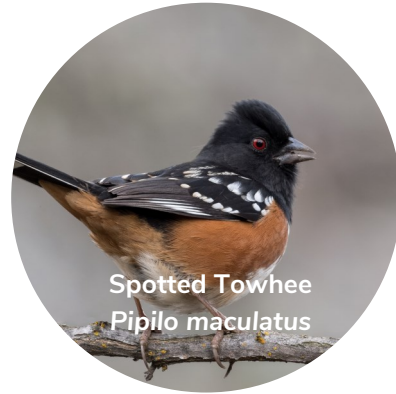
Spotted Towhee Pipilo maculatus