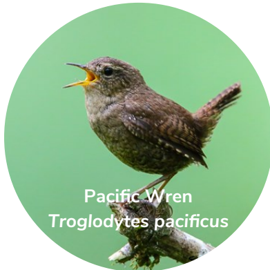
Pacific Wren Troglodytes pacificus