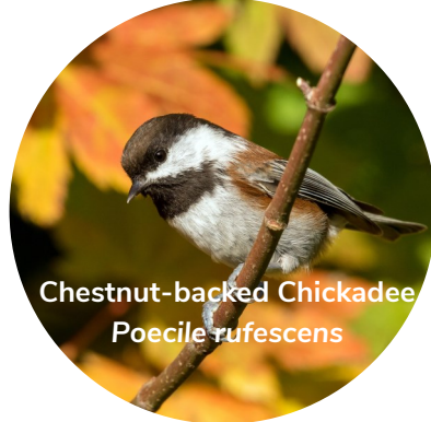
Chestnut-backed Chickadee Poecile rufescens