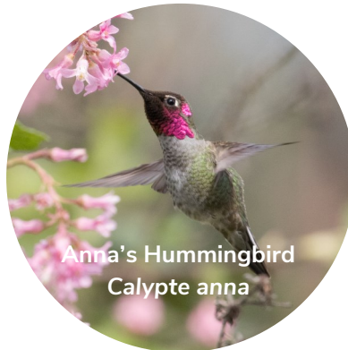
Anna's Hummingbird Calypte anna