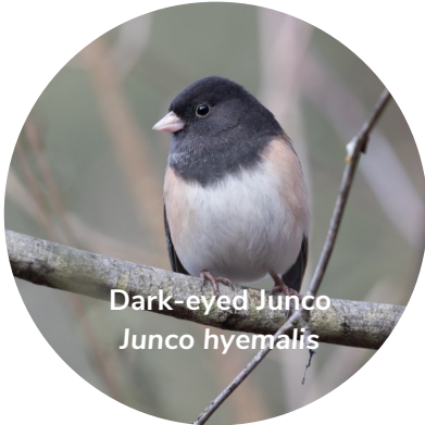
Dark-eyed Junco Junco hyemalis