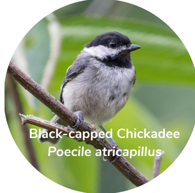
Black-capped Chickadee Poecile atricapillus