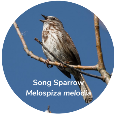
Song Sparrow Melospiza melodia